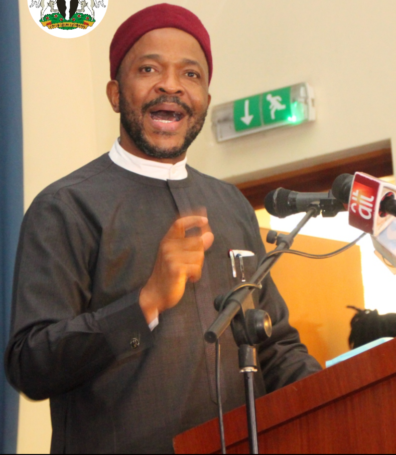
CHUKWUEMEKA NWAJIUBA Minister of State for Education