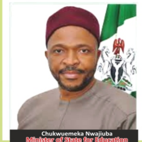
Chukwuemeka Nwajuba Minister of State for Education