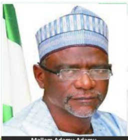
Mallam Adamu Adamu Minister of Education